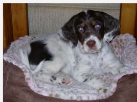
This is me at 7 weeks old! I kicked the cat out of her bed. At least I am higher on the totem pole than she is!