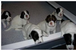
Litter "D", January 18 th , 2008