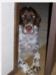
This is me being really sneaky trying to get into the puppy nursery to catch a glimpse of my half-sibs of Litter E.